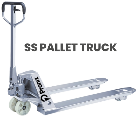
SS PALLET TRUCK