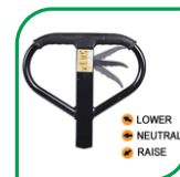
3 STAGE RELEASE LEVER