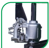
AC CASTING PUMP