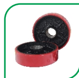
PU STEERING WHEEL