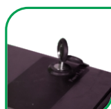
EMERGENCY KEY RELEASE