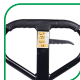
RUBBERIZED HANDLE BAR