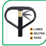
3 STAGE RELEASE LEVER