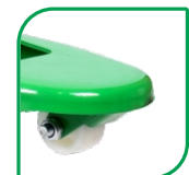
ENTRY / EXIT ROLLER